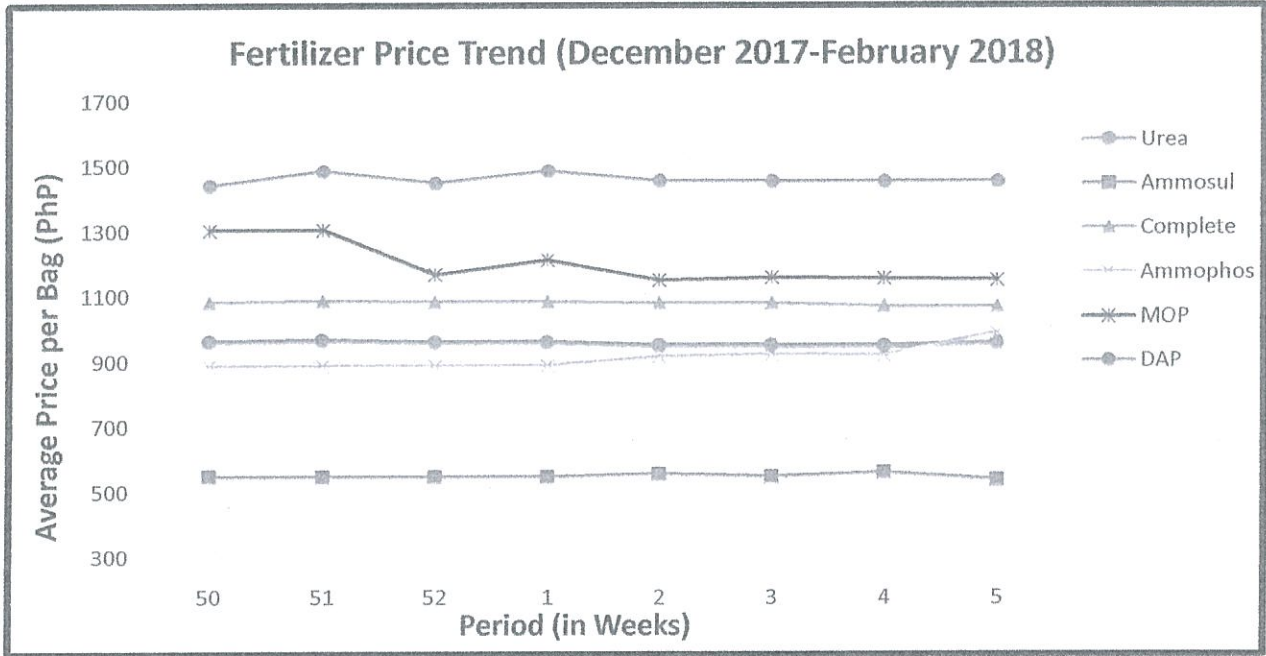
Figure 1. Weekly fertilizer trend of six (6) major fertilizer grades for the period of December 2017 to February 2018 (Week 50-52 of 2017 to Week 1-5 of 2018).