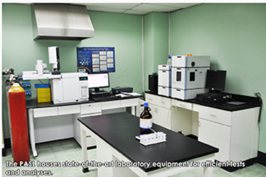
The PASL houses state-of-the-art laboratory equipment for efficient tests and analyses.

"The new services include physico-chemical tests on various pesticide products (i.e., flash point, melting point/boiling point, bulk density and dithiocarbamate analysis) and microbial analysis for E. coli and Total Coliform," elucidated Mr. Bugarin. # (With reports from Angelo Bugarin)