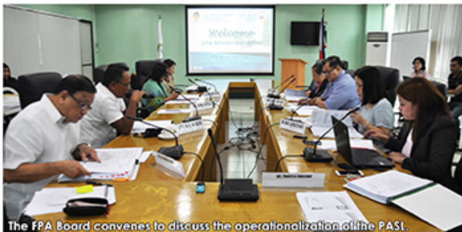
The FPA Board convenes to discuss the operationalization of the PASL.

The approval and signing of the Board Resolution No. 6 "Approving the Proposed Implementing Guidelines on the Conduct of Various Physico-Chemical Analyses in the Pesticide Analytical Laboratory Services Section of the Laboratory Services Division"