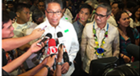
Media reps surround DILG Sec. Mar Roxas and DOST Sec. Mario Montejo after the opening program.

Invited as the event's esteemed guest and keynote speaker was Department of Interior and Local Government (DILG) Secretary Manuel "Mar" A. Roxas II. "No longer is DOST and its agenda of science and technology just for talking purposes or for compliance purposes. It is in fact in the very fabric of